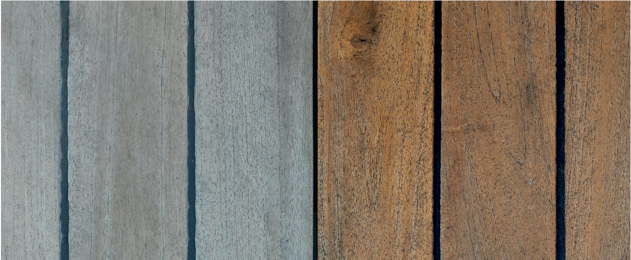
Teak treated with a traditional oil for outdoor, after 10 months.

Pro-Deck has a much longer lasting time than any traditional oil for outdoor purposes.